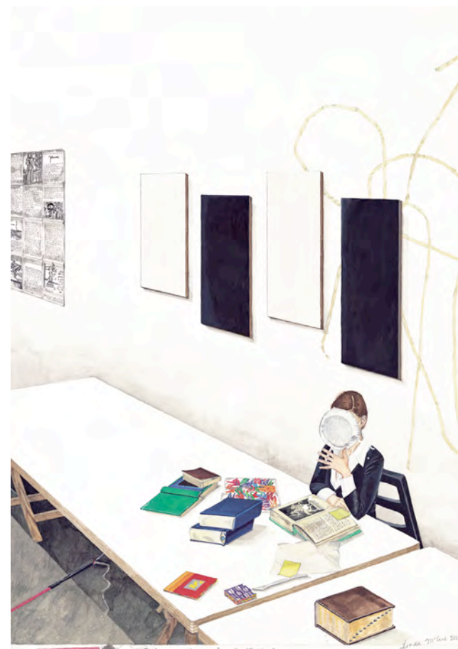
Linda McCue Artist and Pie 2006, Pencil, watercolour on paper, 51 x 36 cm

SUCRE® c/o weiswald 9, avenue taillade f 75020 paris ++33 1 46 36 18 85 weiswald@cafeaulit.de http://cafeaulit.de